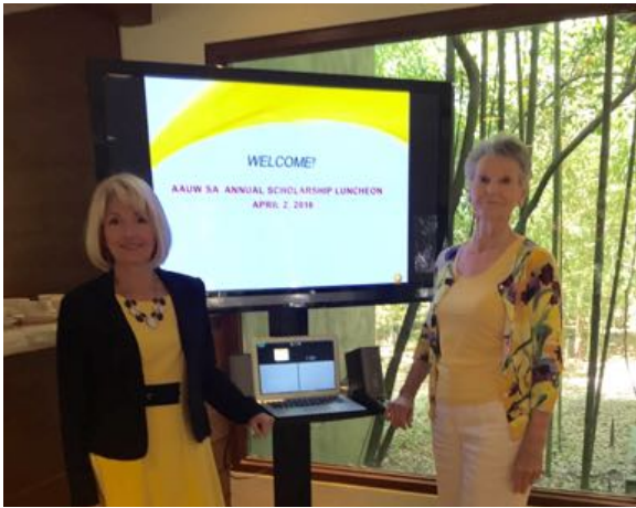
AAUW SA Annual Scholarship Luncheon