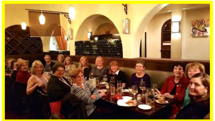
February Meeting & Luncheon at Palenque Grill