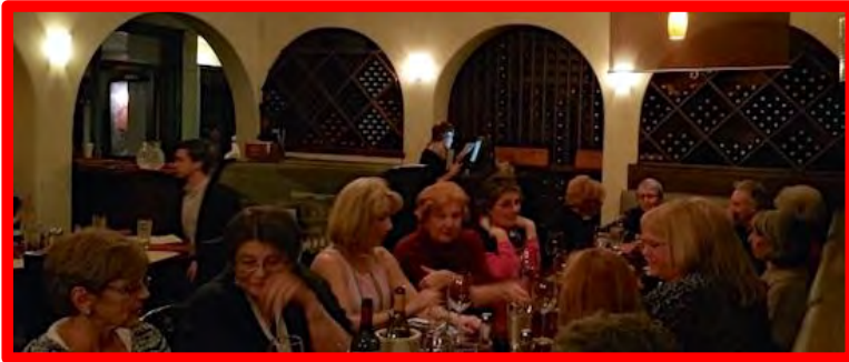
Wine, Women, and Wisdom