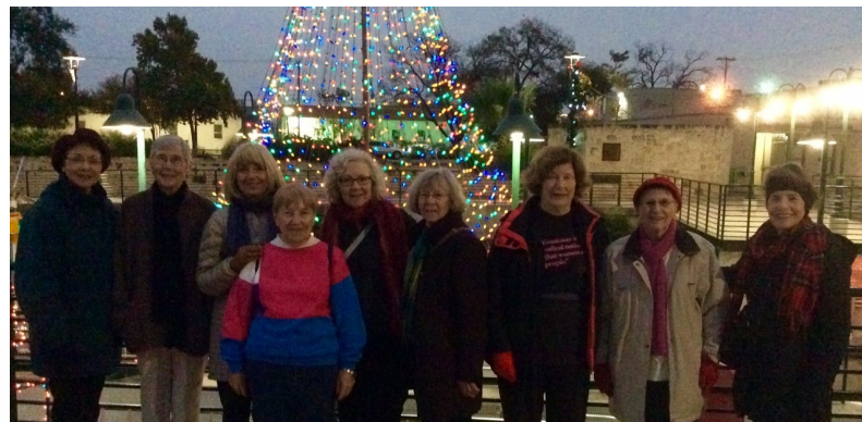
Christmas lights on the Riverwalk with Wandering Wonders

Contact Malinda Gaul mgaul@satx.rr.com 210-410-8992